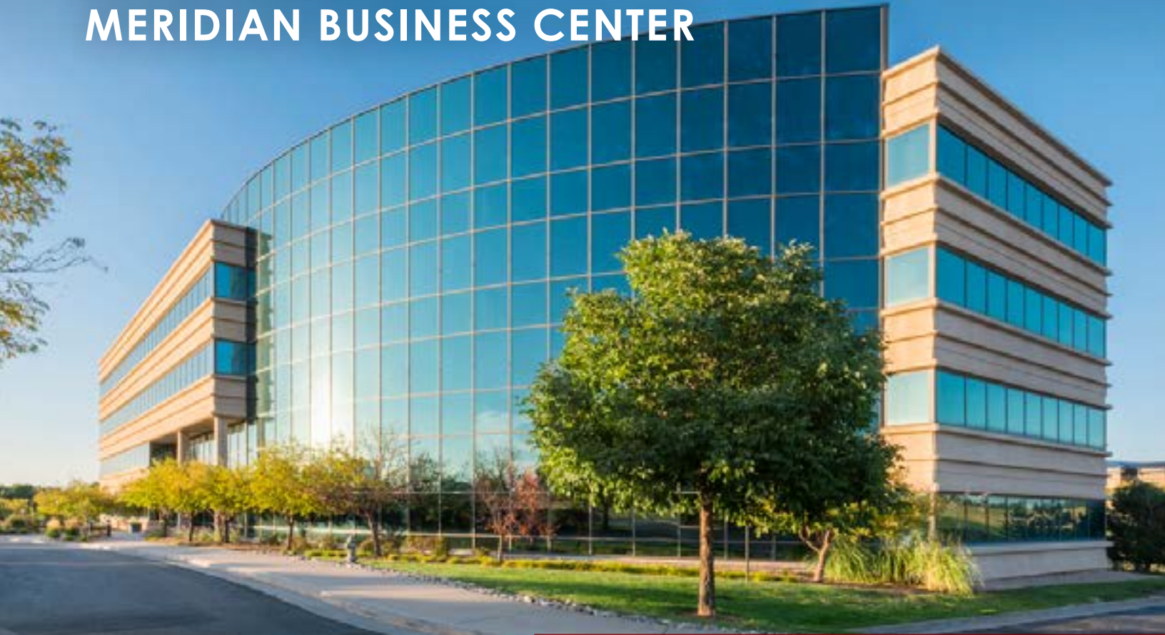
Three Maroon 9635 MAROON CIRCLE | ENGLEWOOD, CO 80112